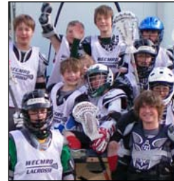
HOWARD HEAD ON-SITE