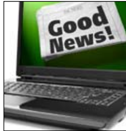
EMPLOYEE SELF SERVICE