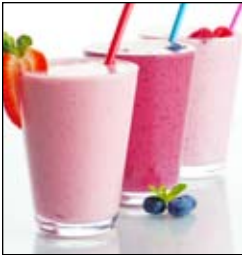
SPD IS MAKING SMOOTHIES