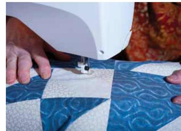
The art of quilting